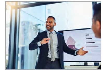
Meet how you feel comfortable