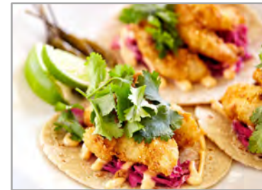
Eat well to meet well