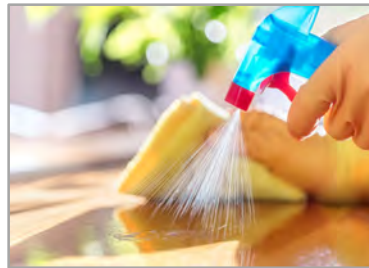
We're committed to cleanliness