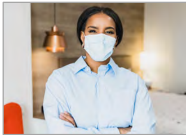
What we're doing to protect you